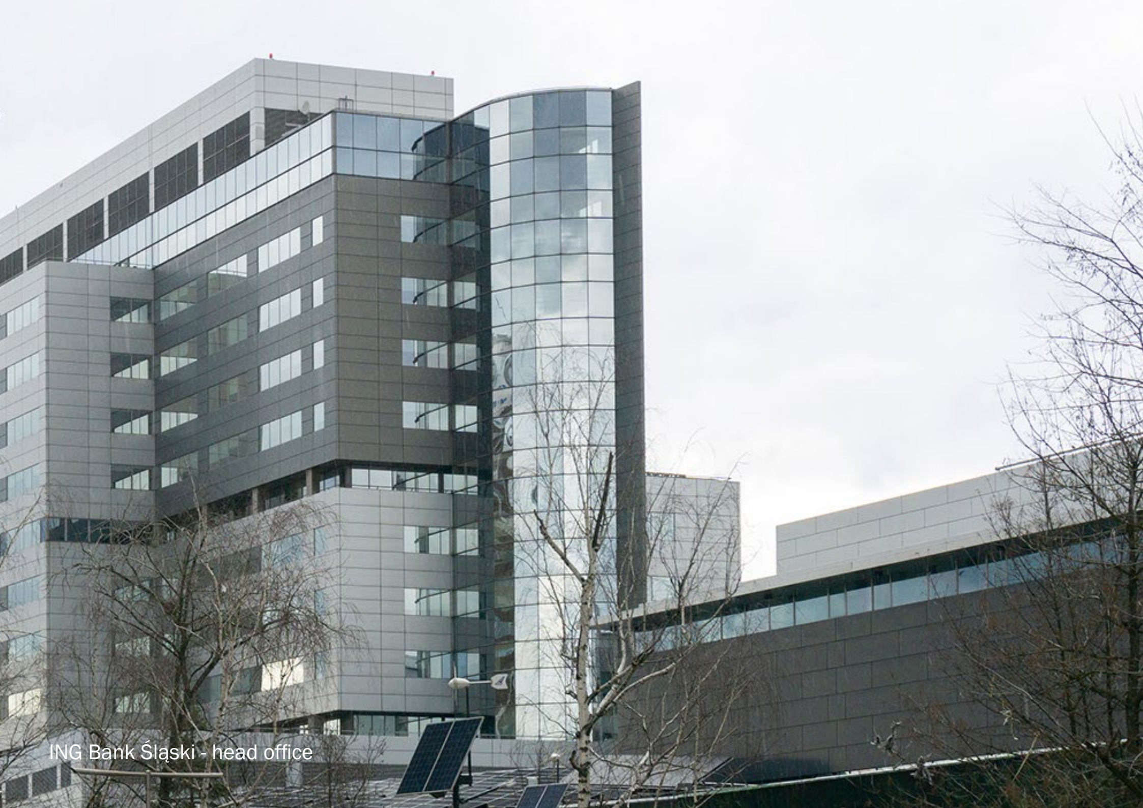
ING Bank Śląski - head office