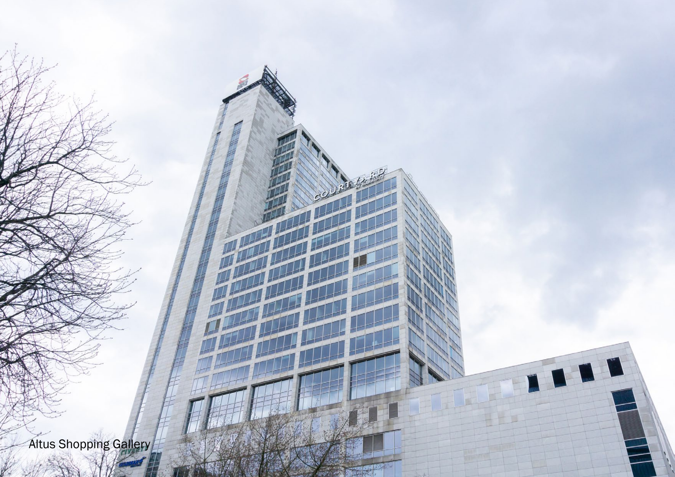
Altus Shopping Gallery