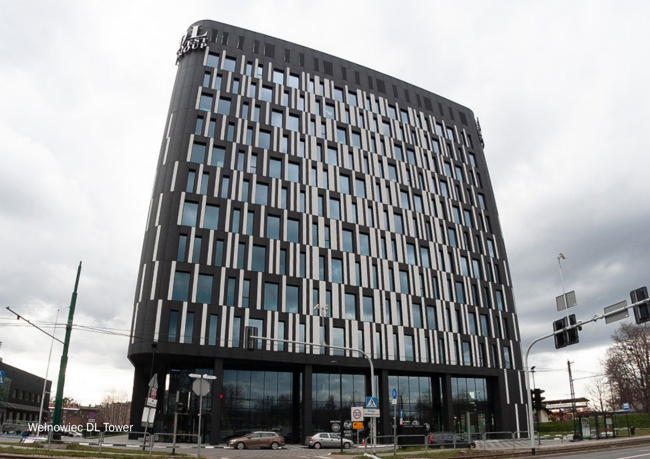
Welnowiec DL Tower