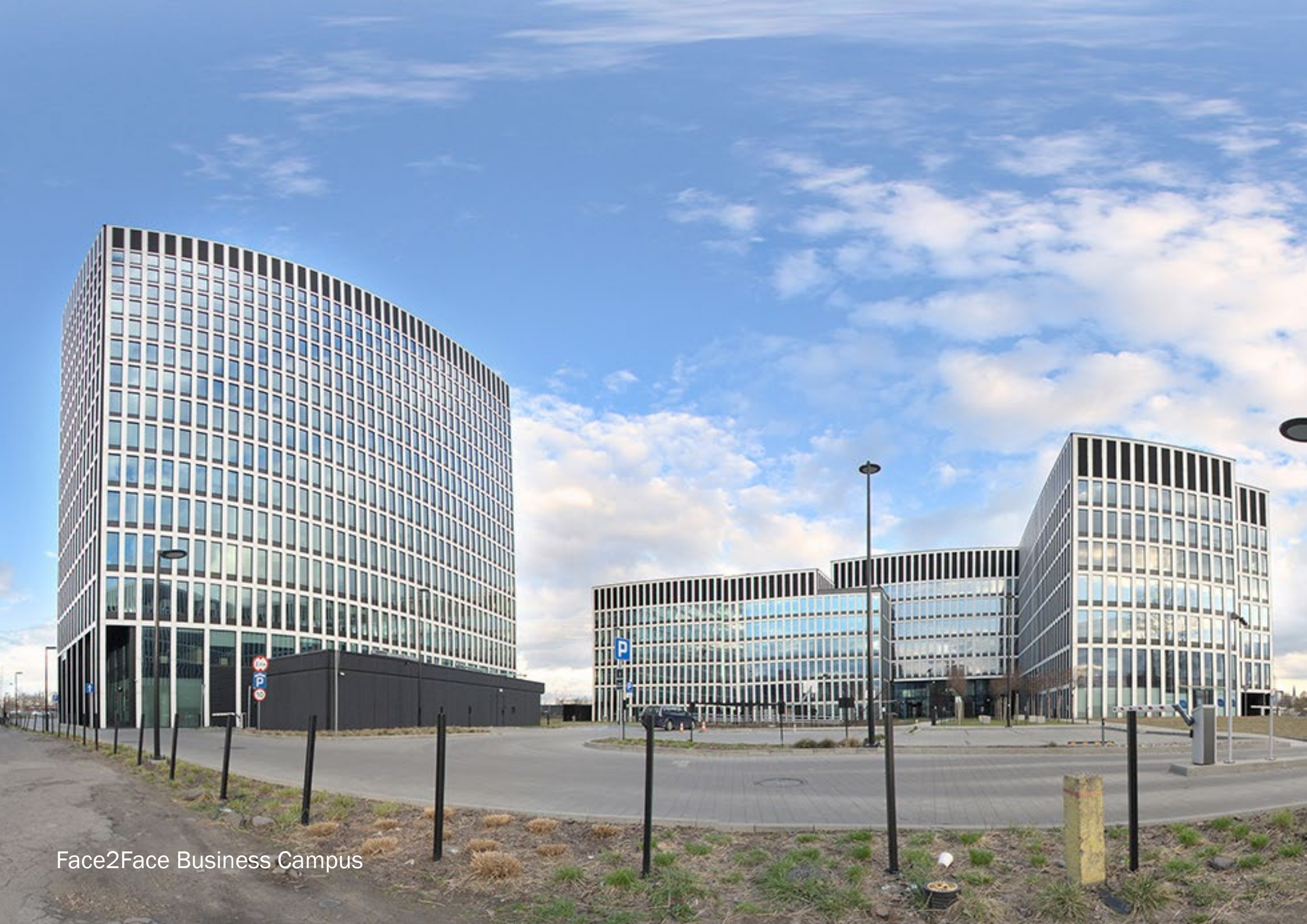
Face2Face Business Campus