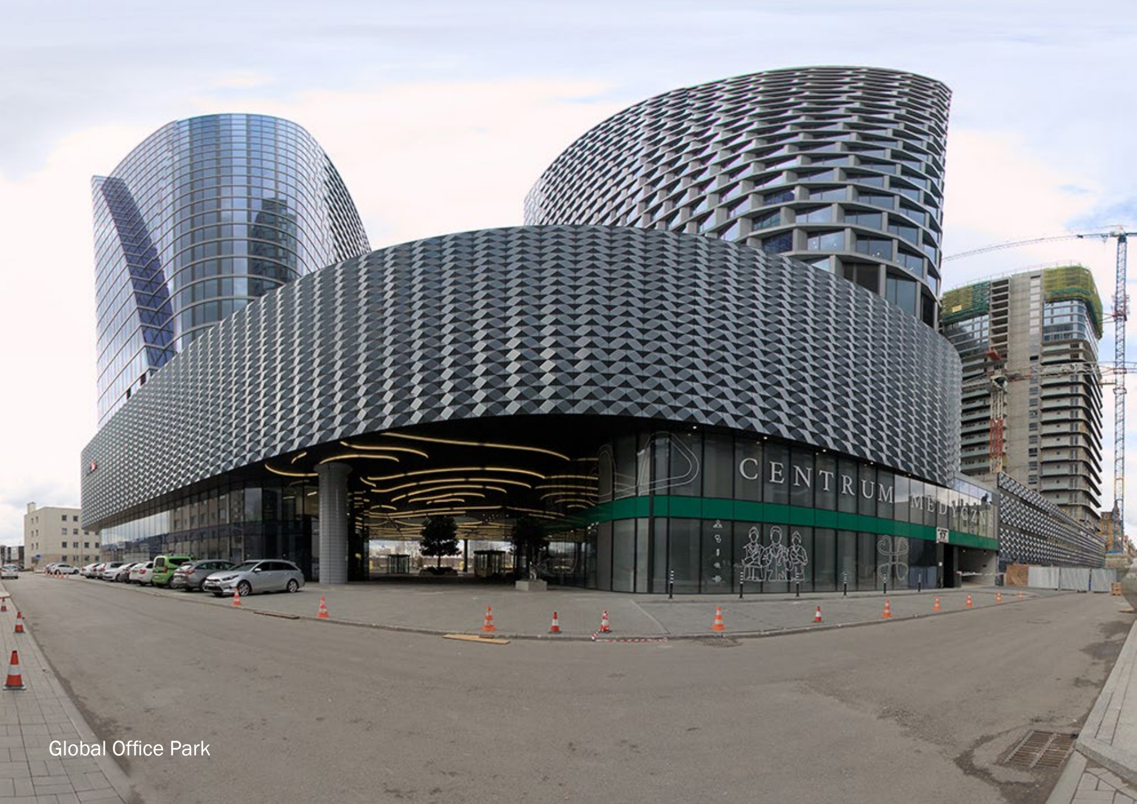
Global Office Park