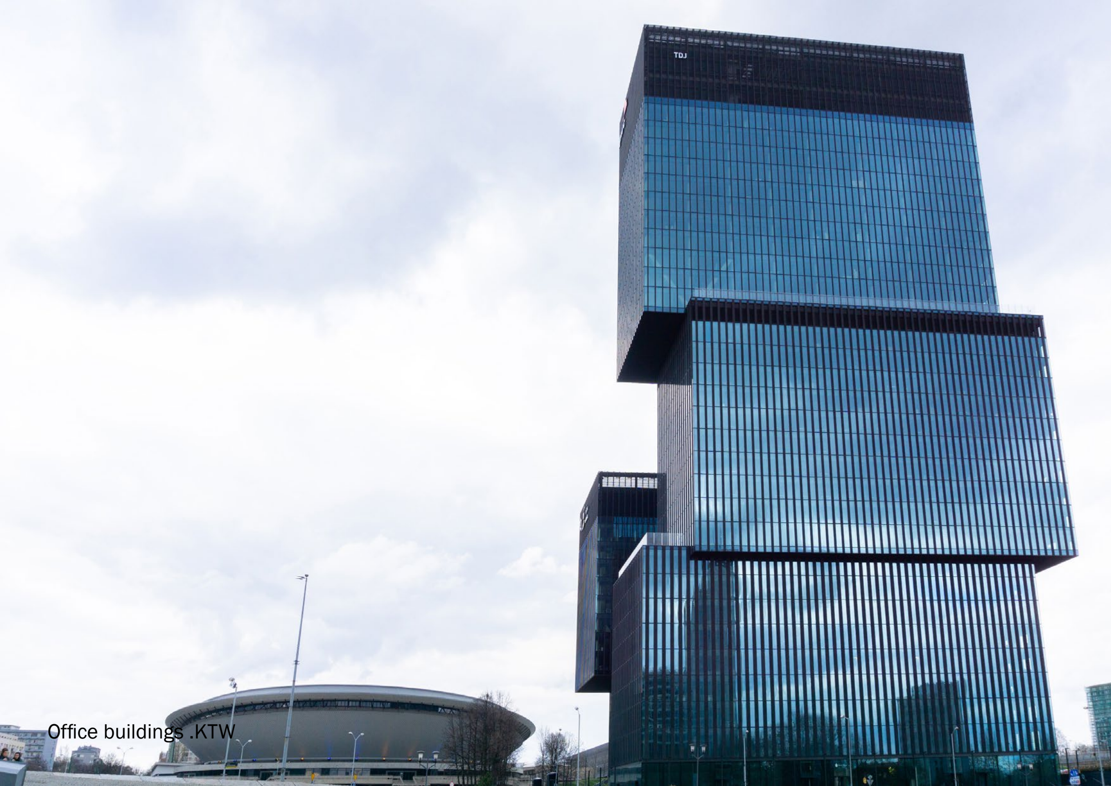
Office buildings .KTW