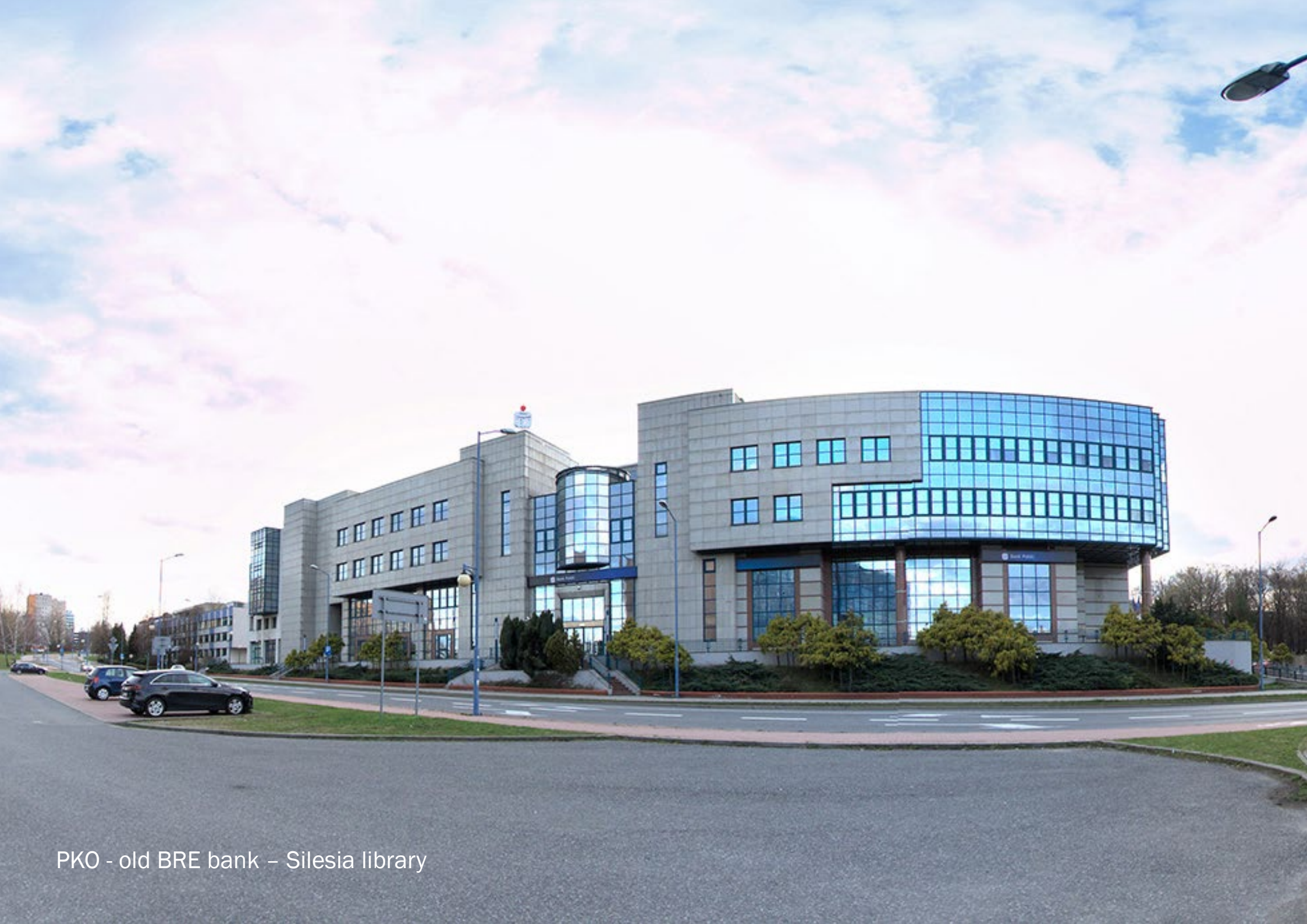
PKO - old BRE bank – Silesia library