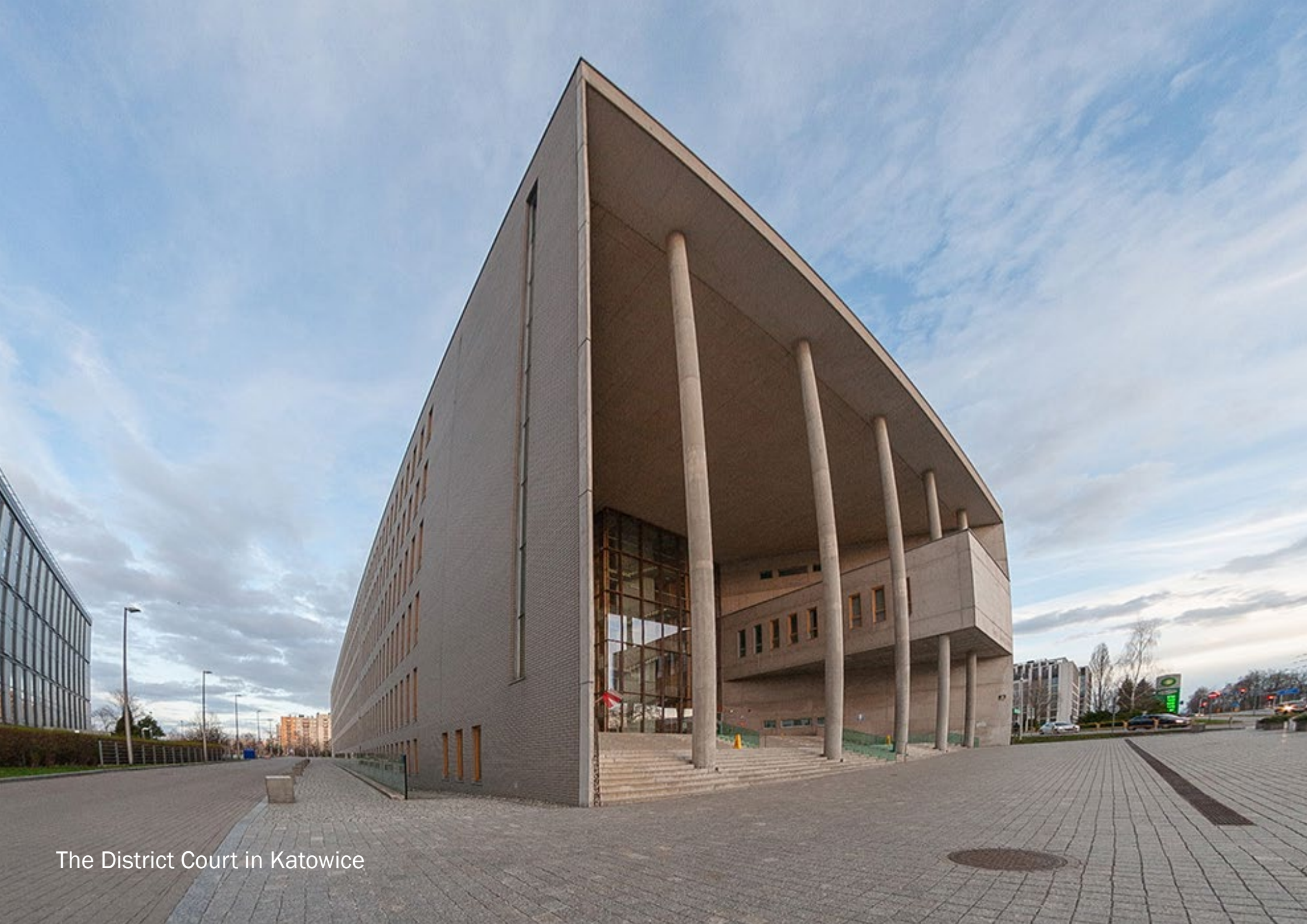
The District Court in Katowice